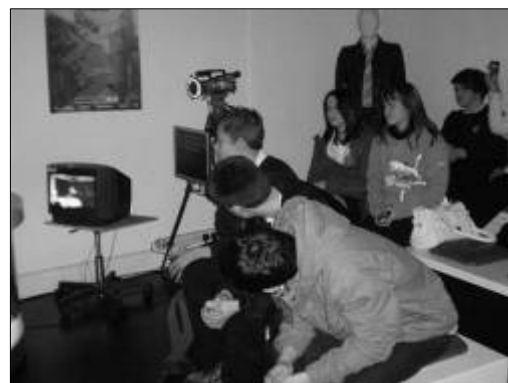
“On air” in the studios