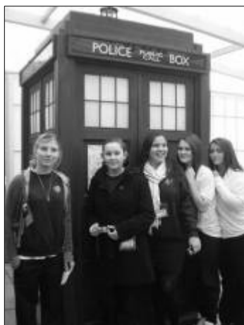
Year 10 girls consider a spot of time travel!