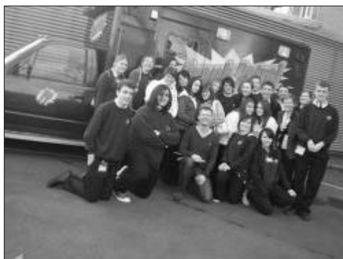
Students pose in front of The “prank Patrol” bus!

The tour lasts around an hour and a half and going home everyone agreed it was a great experience and gives media students a more in-depth understanding of this most famous TV headquarters in the world.